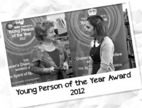
Young Person of the Year Award 2012