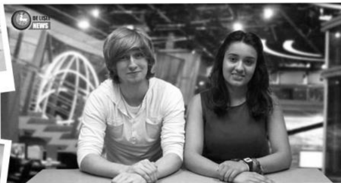
Your new anchors!