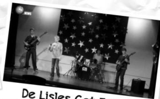
De Lises Got Talent